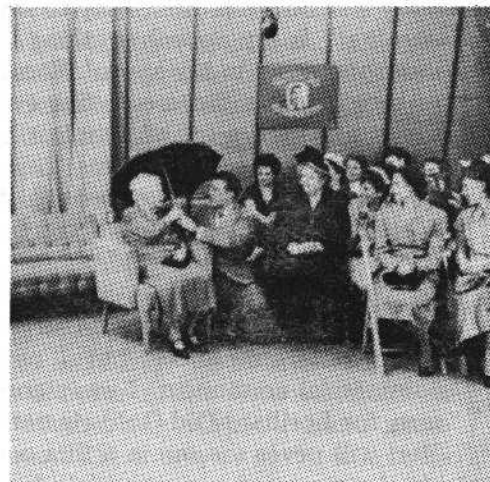
1946 — Okay Mother , an audience participation show ran for seven years, on the Dumont Network.