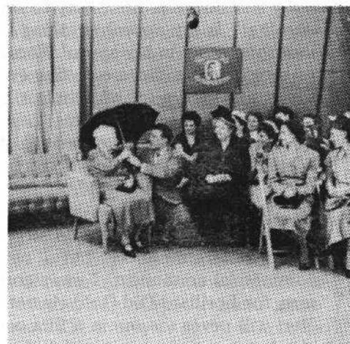
1946 — Okay Mother , an audience participation show ran for seven years, on the Dumont Network.