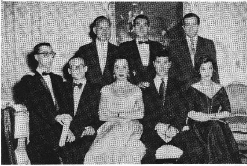
1954 — Dennis as MC on Name's the Same on ABC. Front row from left: Arnold Stang, Roger Price, Bess Myerson, Gene Rayburn and Joan Alexander. Back row: Mark Goodson, Dennis, and Bill Todman.