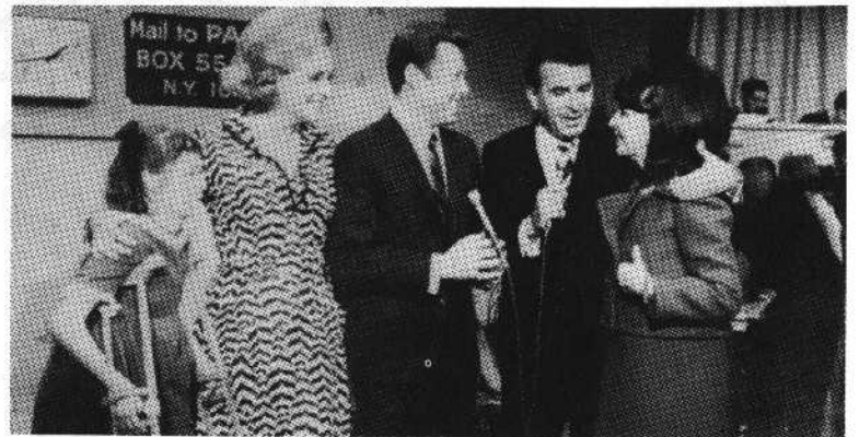
1965 — Cerebral Palsy Telethon from New York, WOR, with CP child and telethon regulars, Jane Pickens, Steve Lawrence, Dennis and Eydie Gorme.